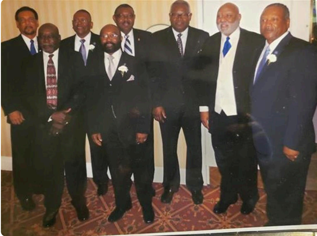
Phi Beta Sigma